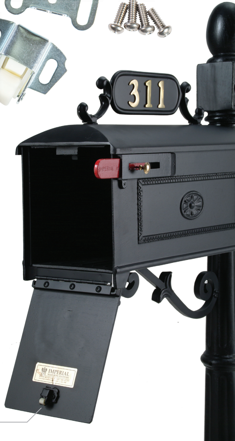
INSTALLED RLR CATCH ASBL