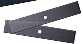
(2 screws/2 nuts are included with the straps)