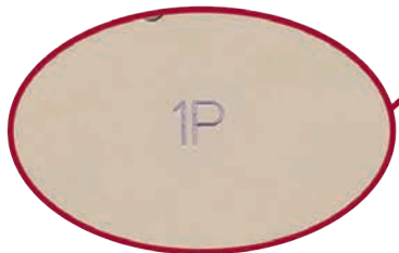
Standard decals or 3/4" H engraving