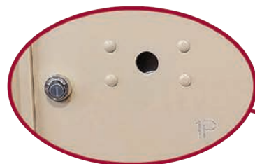
Fully integrated parcel locker(s) with key trapping lock