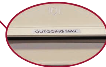
Integrated Outgoing Mail Slot with weather protection hood