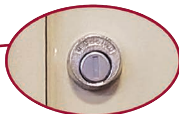
Heavy duty tenant cam lock with three keys