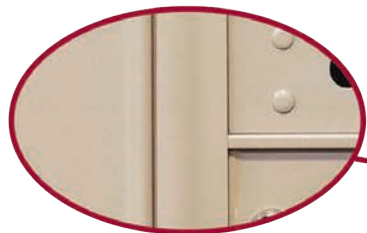
Interlocking, overlapping seams to prevent prying