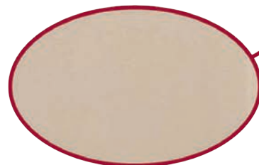
Rugged, weather-resistant powder coat finish