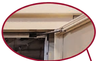
Stainless steel hold open door catch on each side of master gate