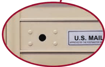
Solid aluminum integrated outgoing mail collection compartment prepared for USPS installed Arrow Lock