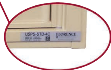
Product and manufacturer ID serial tag