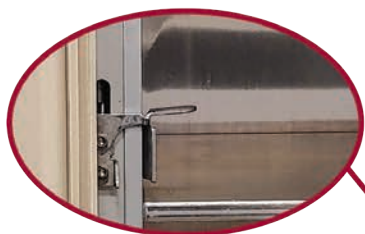
Easy release handle to open master gate