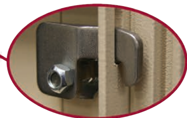
Heavy duty cam latches through frame for added security