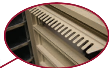
Aluminum comb prevents mail fishing in outgoing mail collection compartment