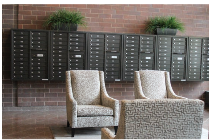
Surface-mounted 4C mailboxes are perfect for limited wall depth projects.

mailbox installation, or starting a new construction project, Imperial stands ready to assist you.